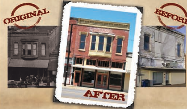
THE SPRING STREET FAÇADE OF THE HENRY ASH BUILDING, C. 1900, WAS RESTORED, INCLUDING THE RECONSTRUCTION OF THE BAY WINDOW WHICH WAS REMOVED APPROXIMATELY 50 YEARS EARLIER.

Our history is rich and preserved. Palestine is one of few Texas towns that retains late 19th century character through its historic homes and buildings. Palestine was formed in 1846, the year after Texas statehood. It was a sleepy little antebellum town until 1872 when the International & Great Northern Railroad arrived. Today, downtown is a unique gem. From coffee shops to specialty shops to a night at the Spanish Colonial architecture of our 1930s Texas Theatre, history comes alive in downtown Palestine. Historic downtown is a great place for eating, shopping, browsing for antiques and enjoying small town culture and hospitality. Add to the experience by taking a trip back in time on a historic train ride with The Texas State Railroad.