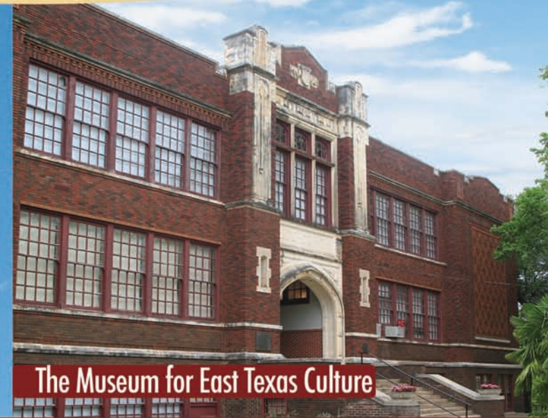
The Museum for East Texas Culture